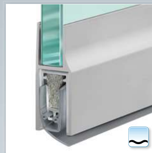
Option: Planet KG-F10 | F12, bevel lip for uneven floors