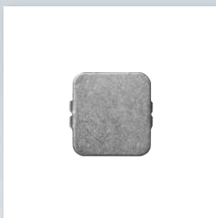
Accessories: Planet frame protector plate, type 1 (stainless), 20 x 20 mm