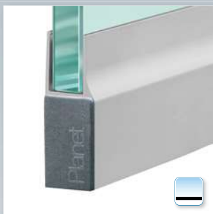
Planet KG-F10 | F12, with cover plate