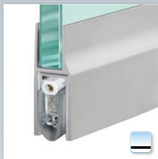
Planet KG-F10 | F12, attached and glued, release side