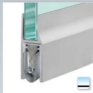
Planet KG-F10 | F12, attached and glued