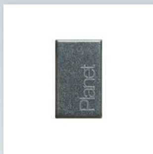
Set of Planet cover plates Planet KG